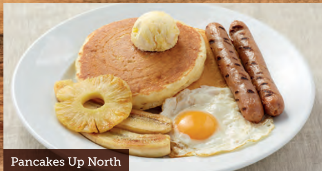
Pancakes Up North